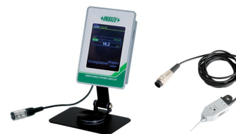
Inductance Type Probes And Display Units