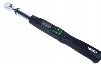
Digital Torque Wrenches