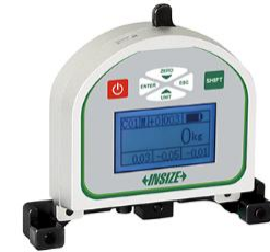
Cable Tension Meters