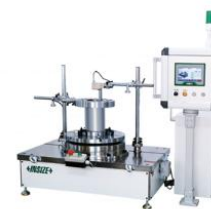
Blade Runout Monitoring Stations