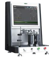
Horizontal Soft Bearing Balancing Machines