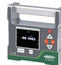
Digital Inclination Levels