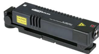
Laser Interferometer Measurement Systems