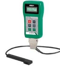
Infrared Belt Tension Meters