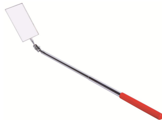
Telescoping Inspection Mirrors