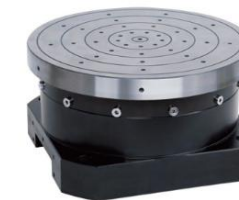
Air Floating Rotary Tables