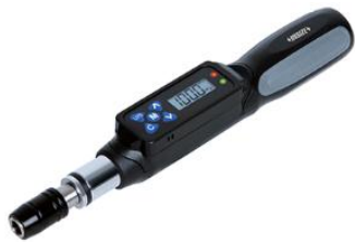
Digital Torque Screwdrivers