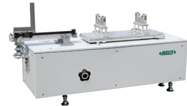
Horizontal Mass And Center Of Mass Testing Machines