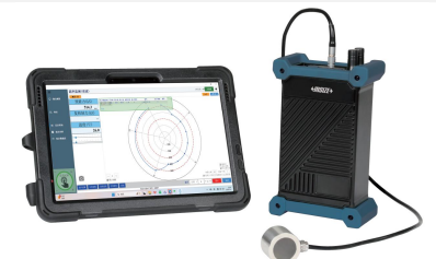
Bolt Axial Force Testers