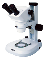
Zoom Stereo Microscopes