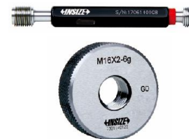
Thread Ring/Plug Gauges