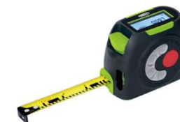
Digital Measuring Tapes + Laser Distance Meters