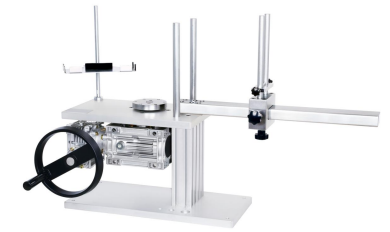
Torque Wrench Test Stands