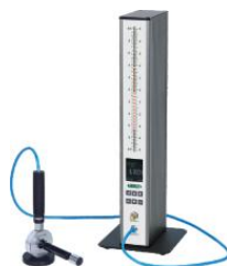
Air Gauges And Displays