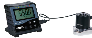
Digital Torque Testers