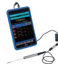
Digital Gap Gauges