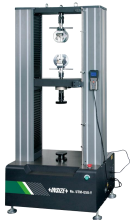
Electronic Universal Testing Machines