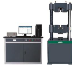
Hydraulic Universal Testing Machines