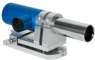
Dual Axis Photoelectric Autocollimators